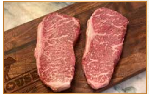
NEW YORK STRIPS