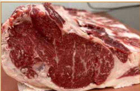
PRIME RIB ROAST