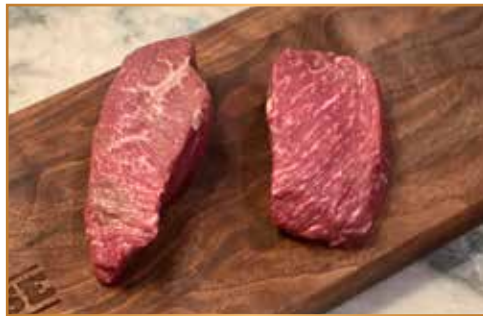
SIRLOIN CAP STEAKS