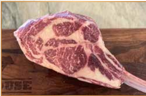
BONE IN COWBOY RIBEYE