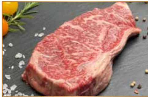
BONE OUT RIBEYE